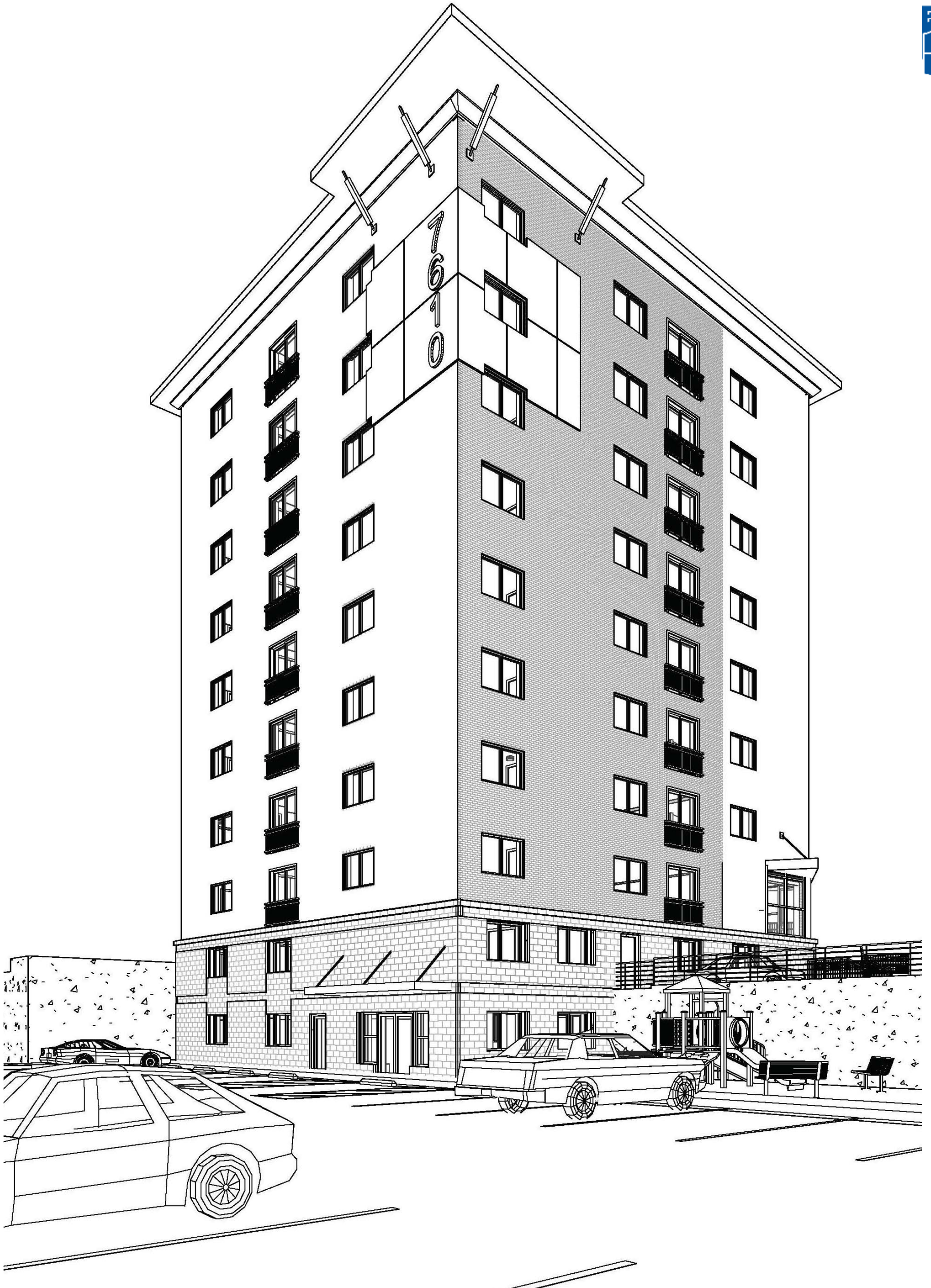
PROPOSED SOUTHEAST PERSPECTIVE