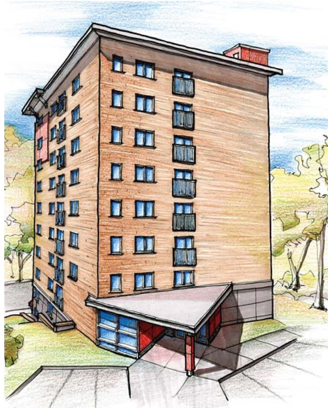
PREVIOUSLY PROPOSED ENTRANCE